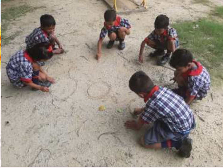
WRITING LETTERS IN SAND