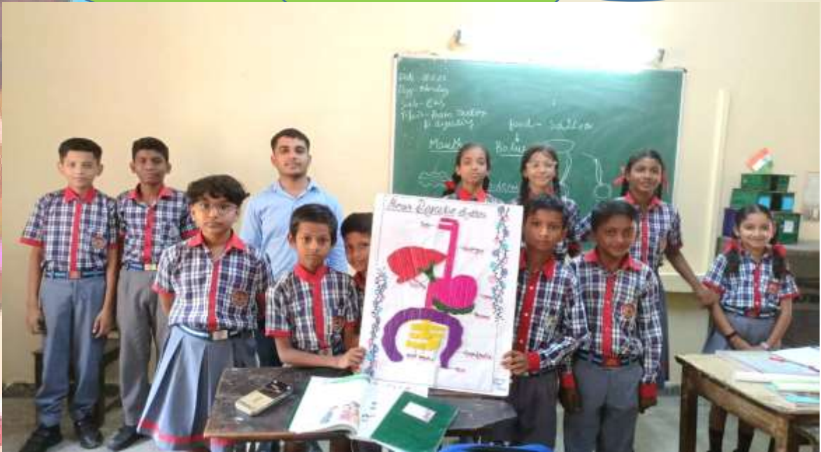
DIGESTIVE SYSTEM (FROM TASTING TO DIGESTING, CLASS-V)