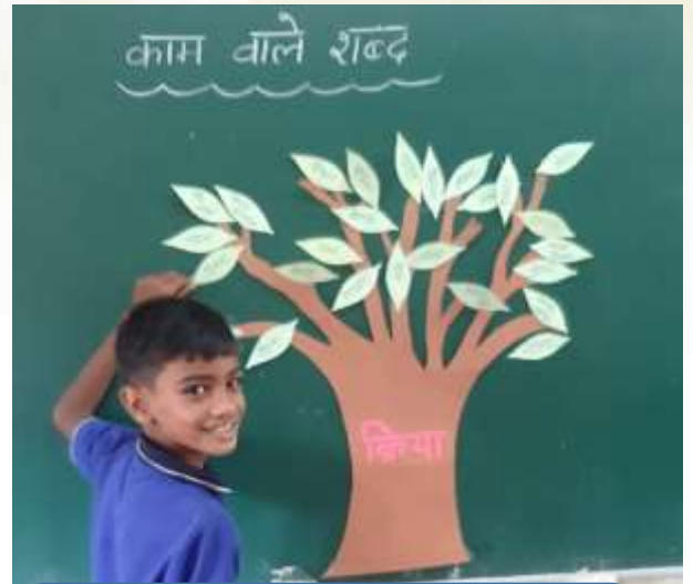
KAAM WALE SHABD