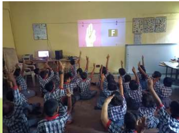
SIGN LANGUAGE (USE OF ICT)