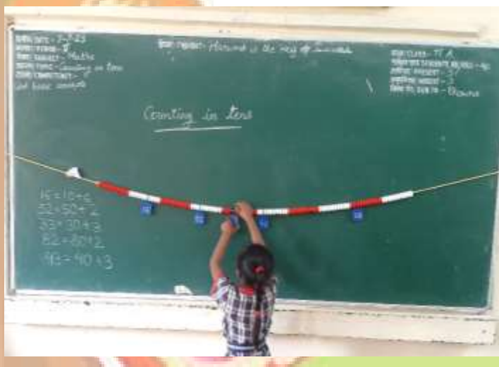
COUNTING IN TENS (USING GANIT MALA)