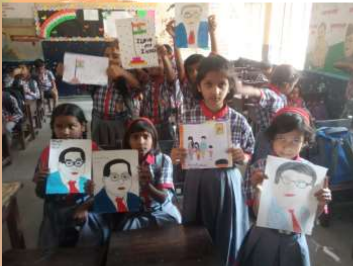
DR. B. R. AMBEDKAR DRAWING