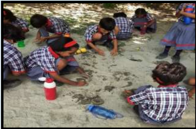
PLAYING IN SAND

Our sole motive to conduct Funday is to provide students a new outlook towards life and learning. On this day various types of activities like dancing, skit, music games, sports & mental maths etc are conducted to make students mentally sound & motivated towards learning.