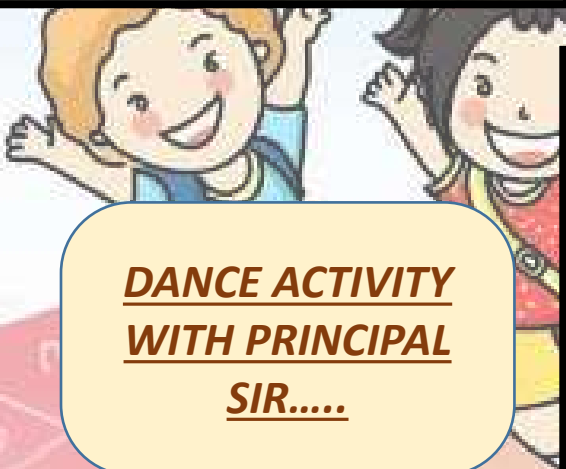
DANCE ACTIVITY WITH PRINCIPAL SIR.....