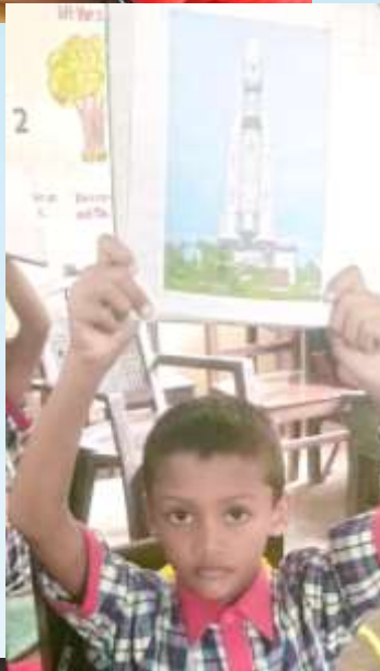
POSTER ON CHANDRAYAN-III